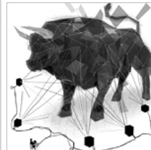
Op-Ed: This Economy Does Not Compute