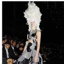
Complete Coverage: Paris Fashion Week