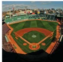
Groundskeepers Display Artistry on the Diamond