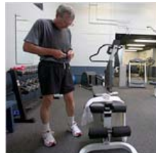
Building Better Bodies